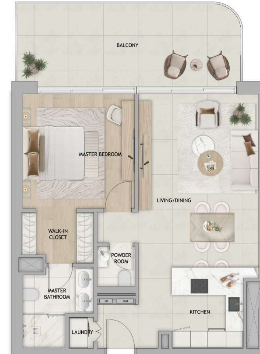
1-BEDROOM TYPE D

Disclaimer: Image is indicative. Actual size and configuration of balconies will be specific to the unit.