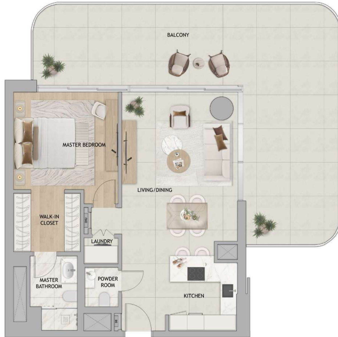
1-BEDROOM TYPE C

Disclaimer: Image is indicative. Actual size and configuration of balconies will be specific to the unit.