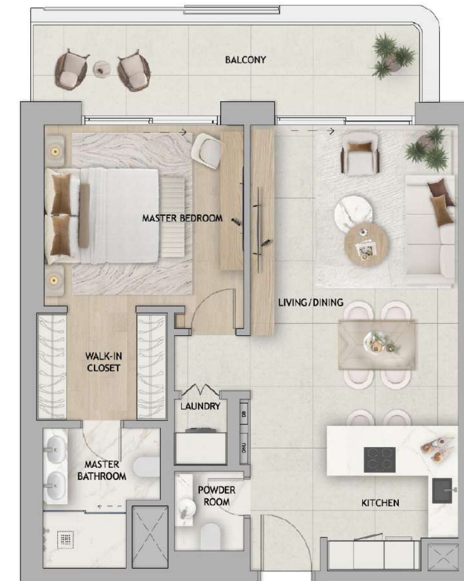
1-BEDROOM TYPE A

Disclaimer: Image is indicative. Actual size and configuration of balconies will be specific to the unit.