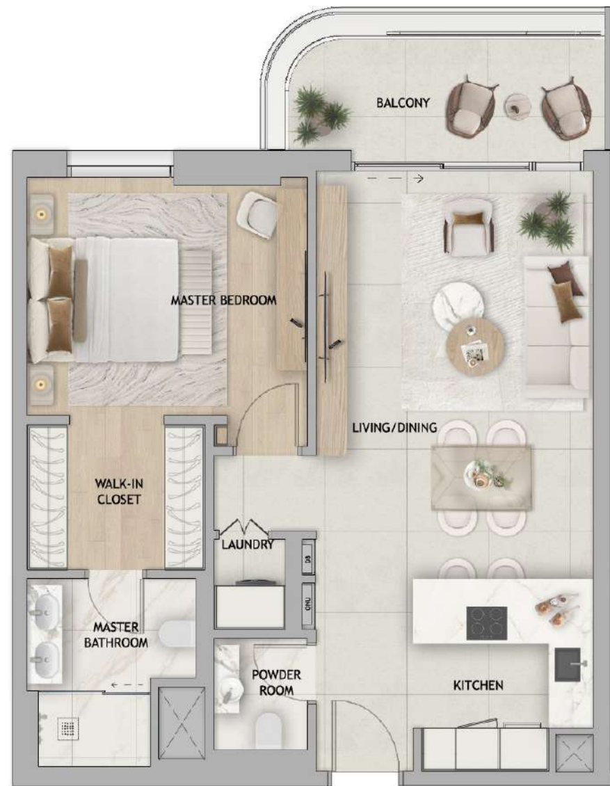
1-BEDROOM TYPE B1

Disclaimer: Image is indicative. Actual size and configuration of balconies will be specific to the unit.