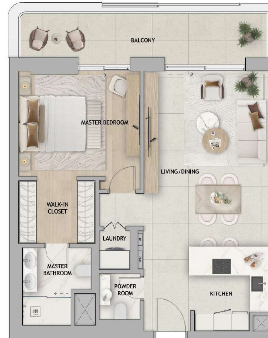
1-BEDROOM TYPE B2

Disclaimer: Image is indicative. Actual size and configuration of balconies will be specific to the unit.